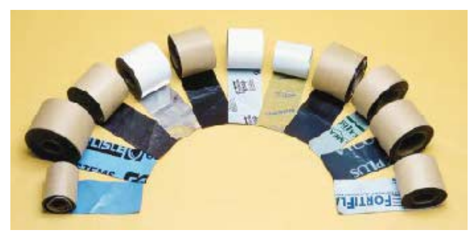
Figure 1. Self-adhering rubberized-asphalt flashings are made of the same material as the eaves membranes used to prevent ice dam leaks.

These flashings are versatile and easy to install. But before slapping peel-and-stick over every exterior crack, you need to be sure you've chosen the right product for a given application. It's also important to know about potential compatibility