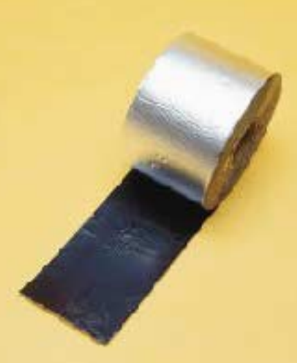
Figure 3. Since foil-topped flashings like Peel'N'Stick from Polyguard Products can be left exposed to the weather for a longer period than polyethylene-topped flashings, they are a good choice when siding installation may be delayed.

problems and to avoid accidentally creating a wrong-side vapor barrier.