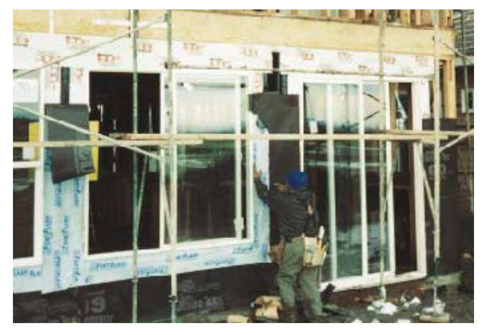
Figure 7. Builders use a variety of methods for flashing windows. This installer has chosen a belt-and-suspenders approach, installing strips of FortiFlash, a rubberized-asphalt flashing, on top of strips of E-Z Seal, a kraft-paper flashing laminated with polyethylene and fiberglass reinforcement.