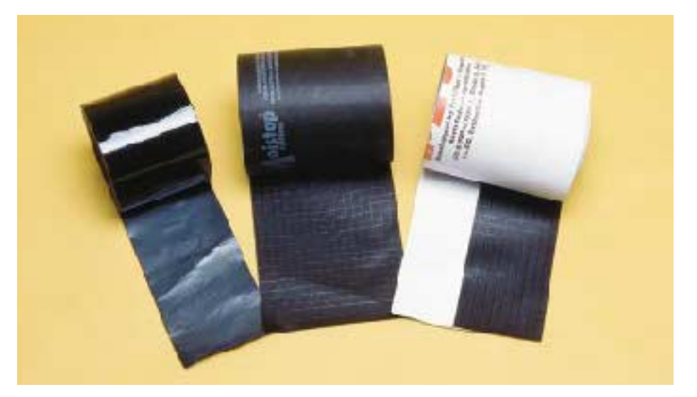
Figure 6. Not all flexible flashings are self-adhering. Future Flash from MFM Building Products (left) and Moistop from Fortifiber (center) are nonstick flashings that are installed with fasteners. Fortifiber's Moistop E-Z Seal (right) is similar to regular Moistop, but includes a 3-inchwide adhesive band along one side of the flashing.