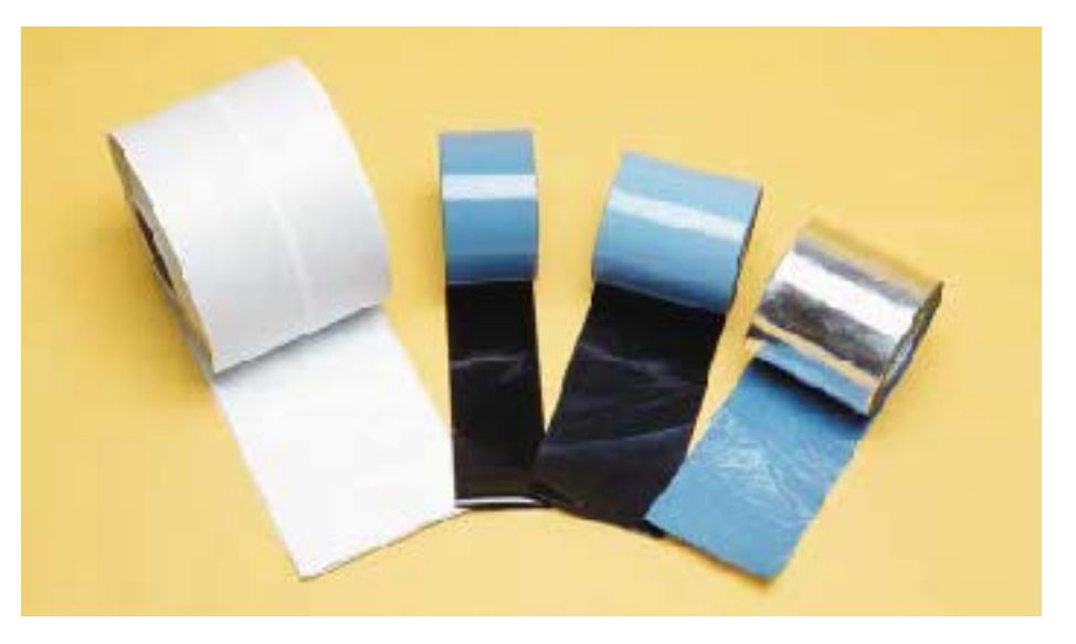
Figure 4. Self-adhering butyl flashings, like rubberized-asphalt flashings, can have a top layer of either polyethylene or aluminum foil. Butyl flashing, although more expensive than rubberized-asphalt flashings, can be installed over a wider temperature range.

Butyl laminated with EPDM. Some butyl flashings are laminated to a top layer of EPDM to make a type of flexible