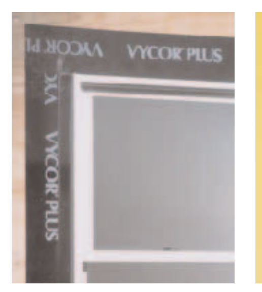
Figure 2. Rubberized-asphalt flashings, like Grace's Vycor Plus, stick well to unprimed plywood. Some manufacturers of rubber-ized-asphalt flashings warn that adhesion to OSB can be difficult unless the OSB is first primed.