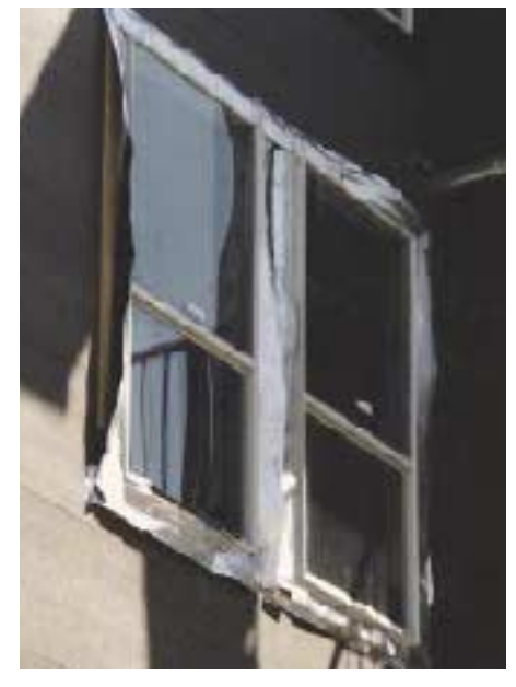
Figure 8. Peel-and-stick flashing adheres poorly to dirty substrates or when applied in cold weather.

support from the manufacturer if something goes wrong.