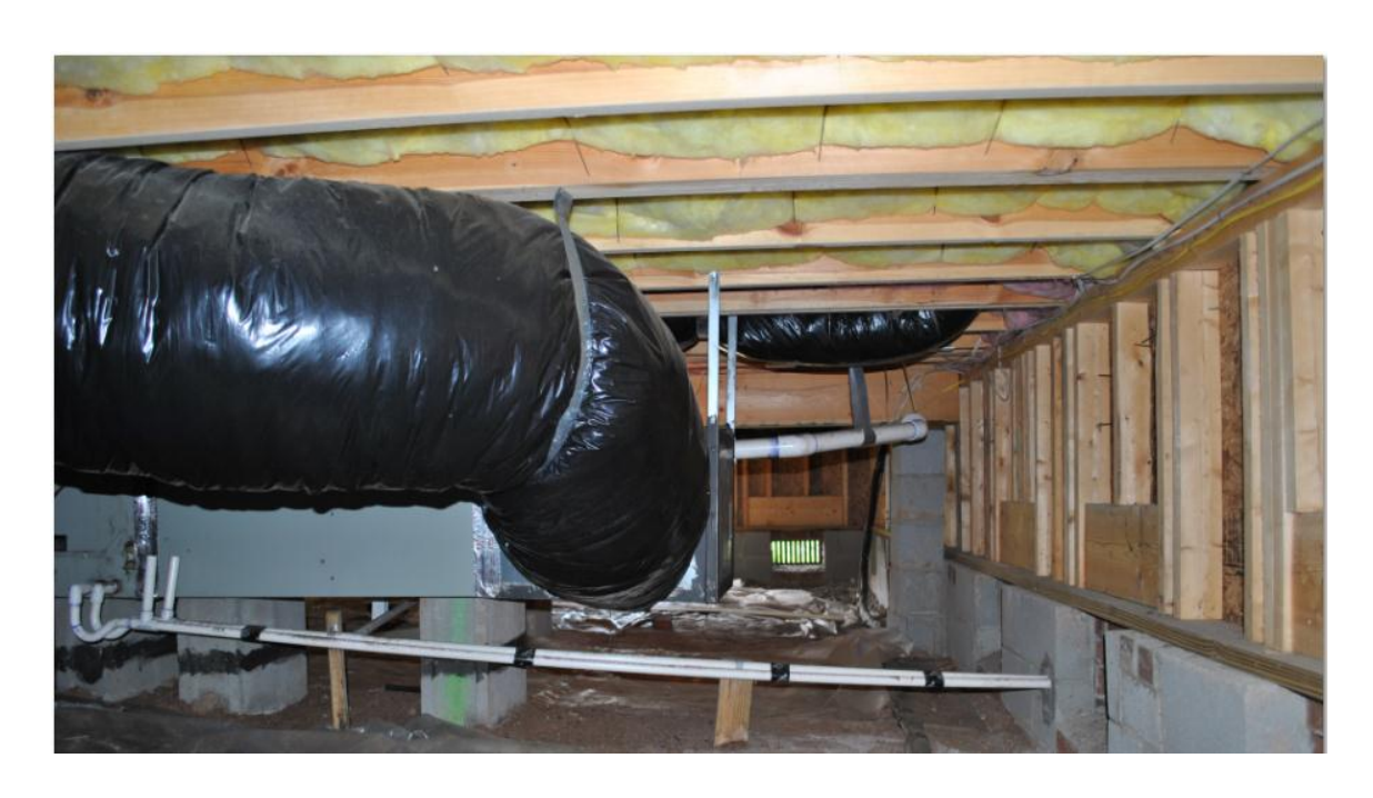
This one shows the entrance of the crawlspace.