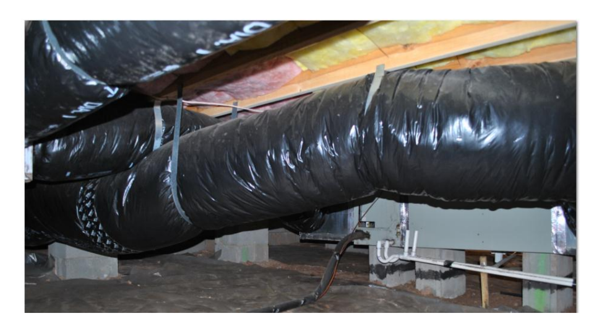
one More picture taken from the center and back part of the crawlspace.